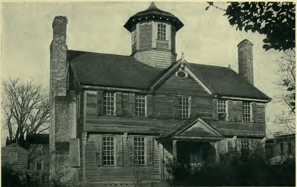
GOVERNOUR EDEN HOUSE, EDENTON, NORTH CAROLINA. Built about 1750 The framed overhang construction is most unusual in the Southern colonies